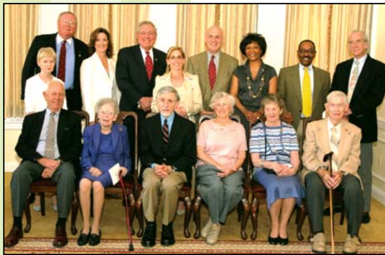
Pictured are 2008 Guardian Society members who attended the luncheon

included Children's Hospital Foundation in their wills or other estate gifts.